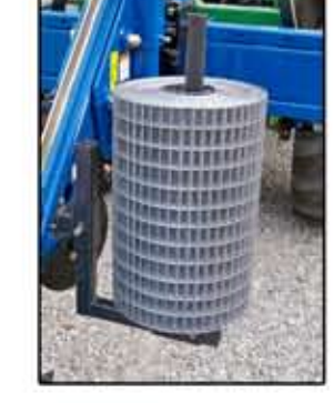
Optional wire un-roller assembly allows you to string out wire reinforcement while installing silt fence. The wire roll can be adjusted horizontally and vertically and placed on either side of the attachment.

The adjustable spring retaining plate keeps the fabric roll perfectly positioned with ideal roll tension.