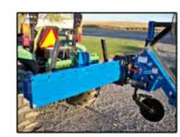
Optional 72-inch and 84-inch sliding offset mounts give you the flexibility to get you close and tackle a variety of work conditions. Handy storage slots keep parking stands securely contained during operation.