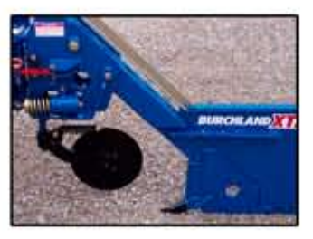
Handy tie holes make transport secure and stable.