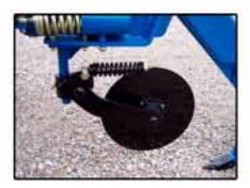
Spring-loaded, hardened-steel coulter with its unique curved arm cuts through trash, roots, and virtually any soil type.

A shear-bolt offers an added measure of protection for the installer blade.