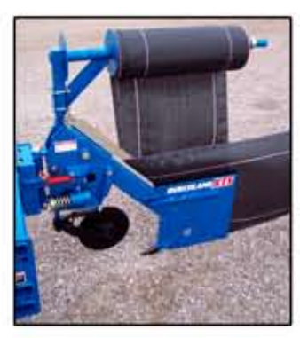
Easy threading rear-discharge fabric chute keeps fabric uniform and free from snags and will accommodate 48", 42", or 36" fabric.