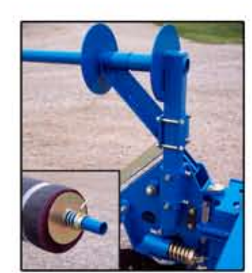
Height-adjustable roll holder allows for a variety of fabric roll lengths.

The adjustable spring retaining plate keeps the fabric roll perfectly positioned with ideal roll tension.