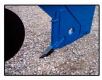
Replaceable blade cutting edge and hardened-steel blade point slice quickly and easily through the toughest soil types.